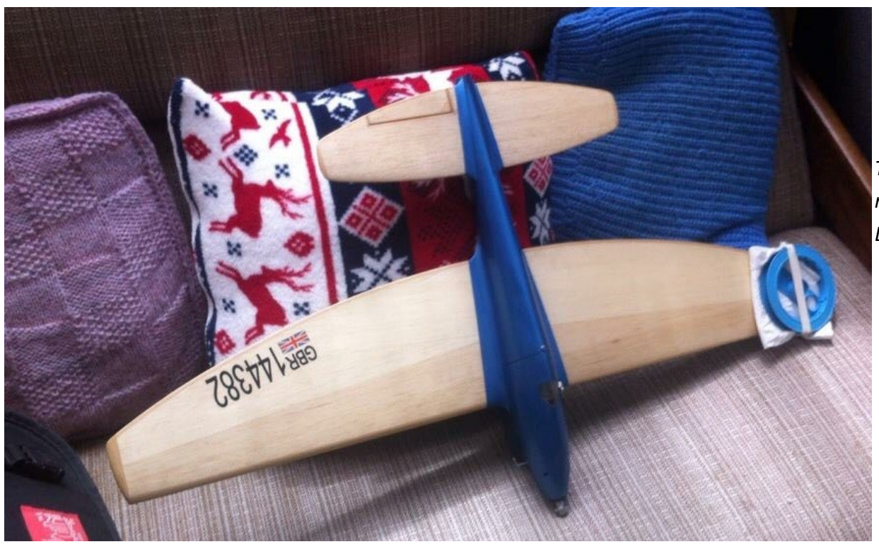
The "Timepiece" model belonging to Duncan Bainbridge.